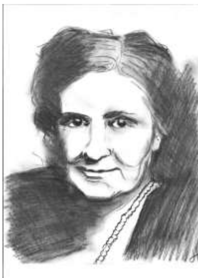
Maria Montessori 1870-1952

"The child's conquests of independence are the basic steps in what is called his 'natural development'." Maria Montessori The Absorbent Mind